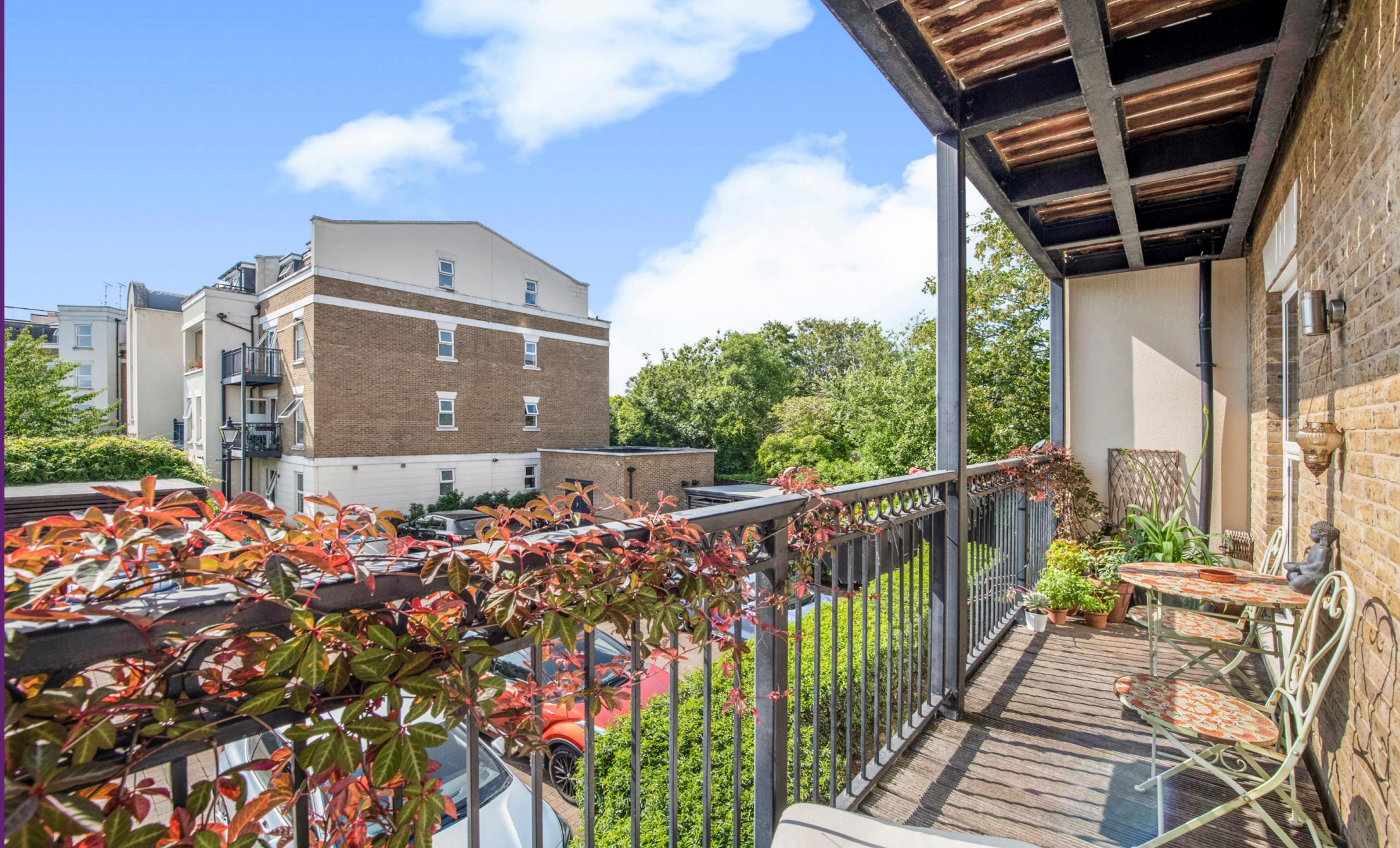
Churchill Court 2 Wadham Mews, SW14