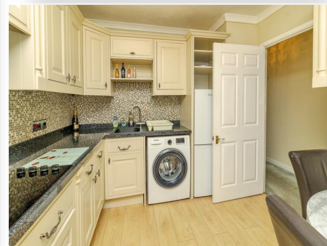
Bekonscot Court, Giffard Park, Milton Keynes, MK14 5QS