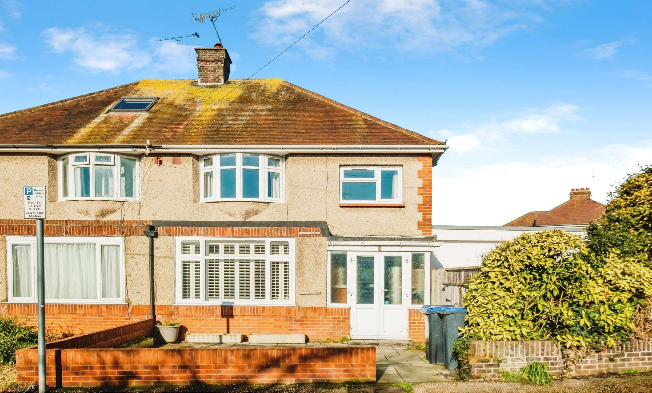
Garrick Road, Worthing BN14 8BE