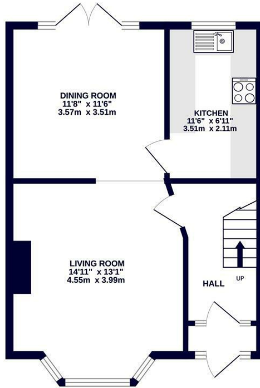
GROUND FLOOR 506 sq.ft. (47.0 sq.m.) approx.