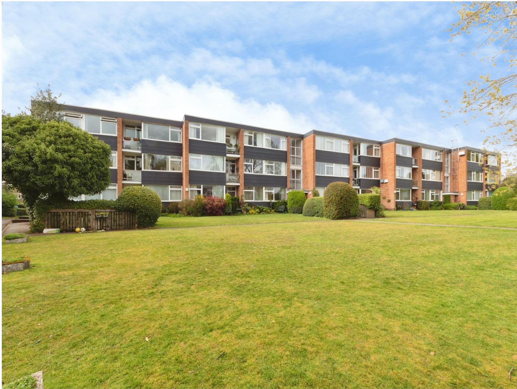
Darley Mead Court, Hampton Lane,,Solihull, B91 2QA