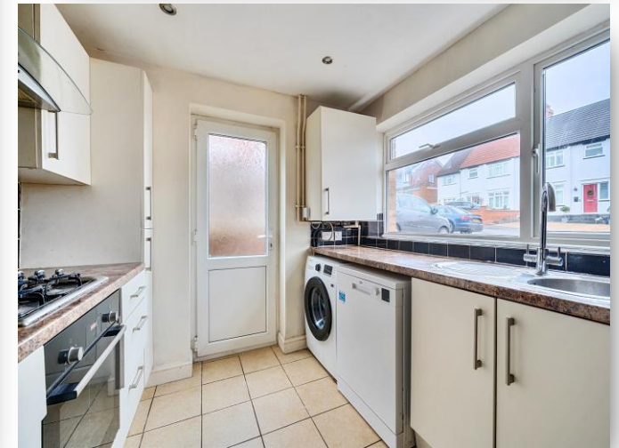
122 Westborough Road, Maidenhead SL6 4AT