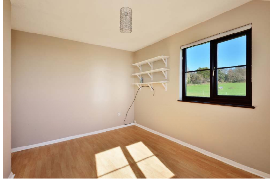
Three double bedrooms with supporting family bathroom