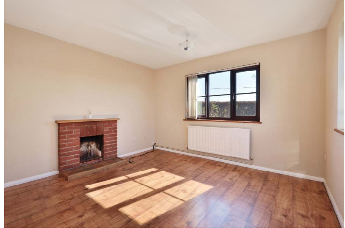
Hallway leading through to sitting room / kitchen/breakfast—living area and utility