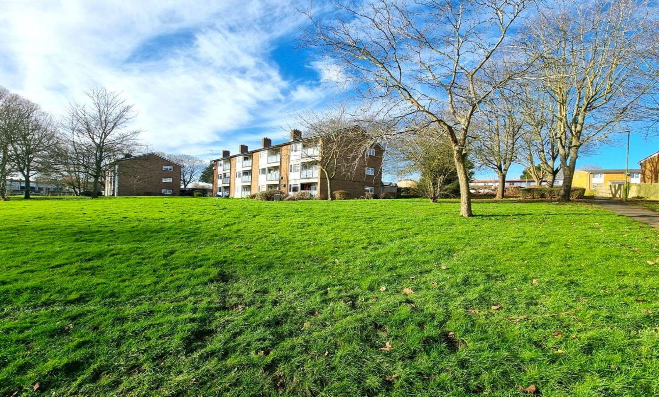
Hillside House, Stevenage, SG1 1PY