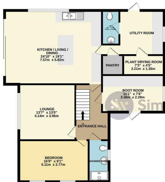
GROUND FLOOR 1013 sq.ft. (94.1 sq.m.) approx.