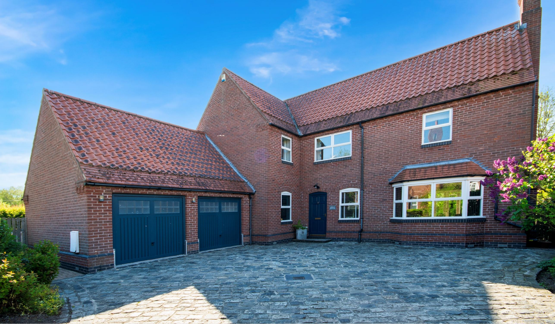
ARRAN HOUSE, EGMANTON £500,000