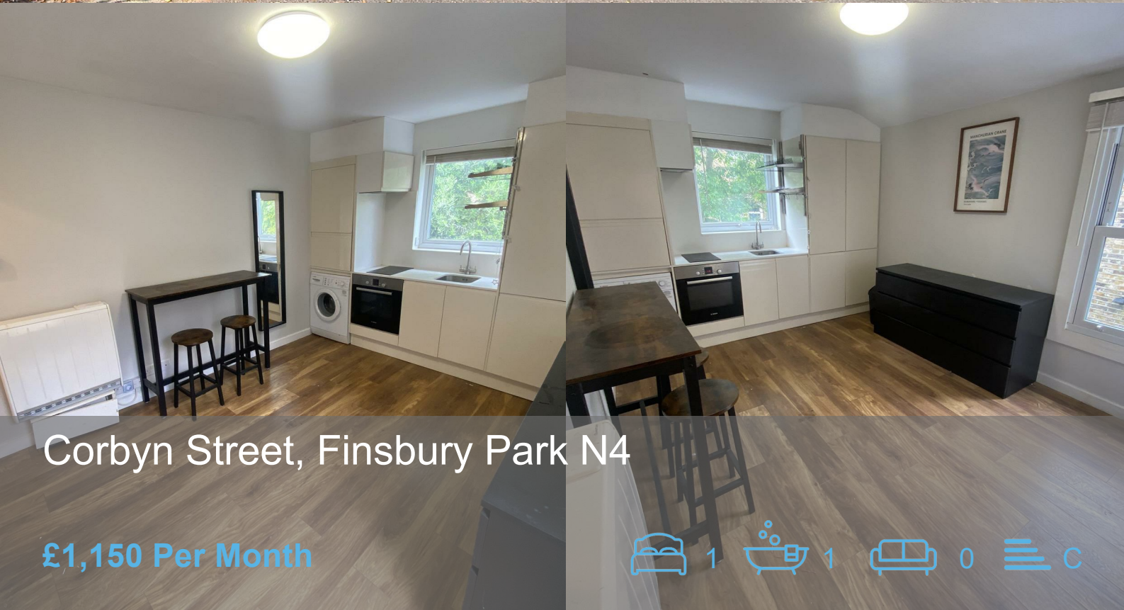
Corbyn Street, Finsbury Park N4