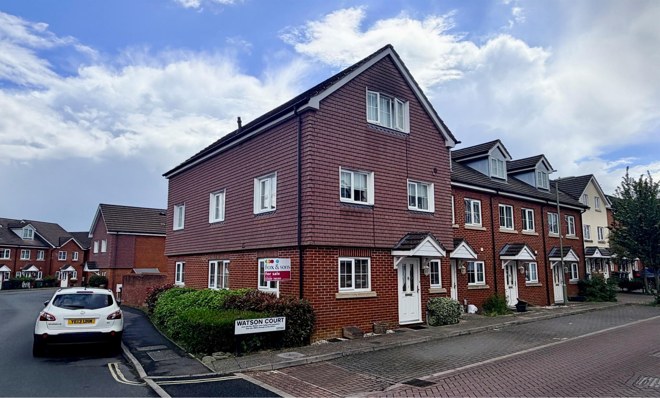
Watson Court, Hedge End, Southampton, SO30 0AQ