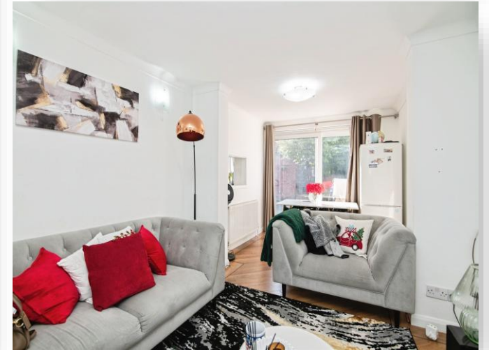
Gorsy Road, Quinton Birmingham B32 2SJ