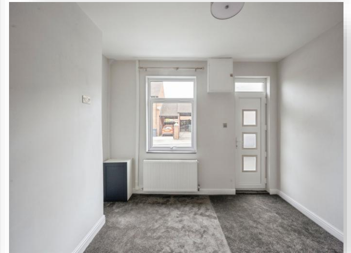
Queen Street, Thurnscoe Rotherham S63 0JN