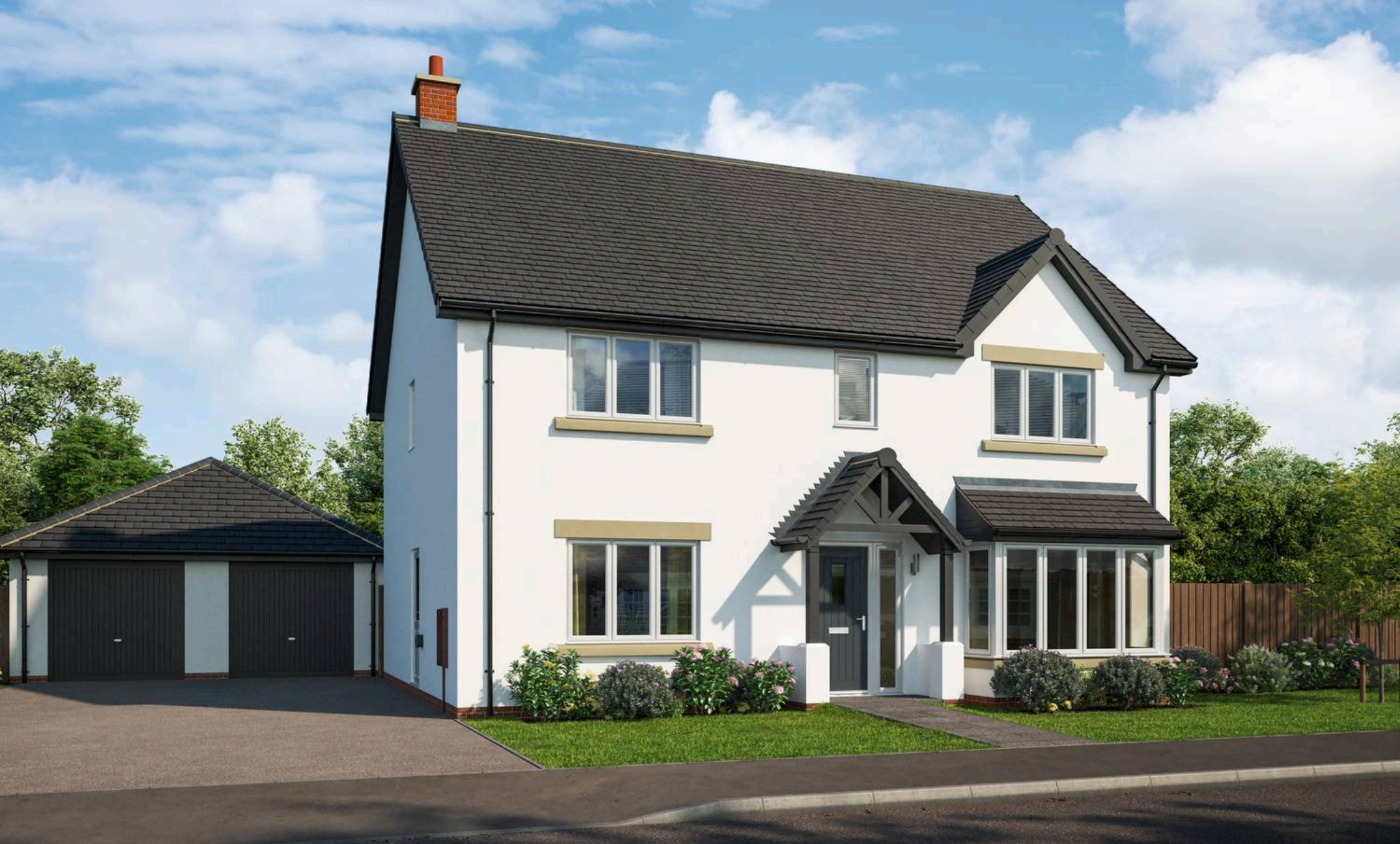
The Willowcrest, Widham Gardens, Station Road Purton