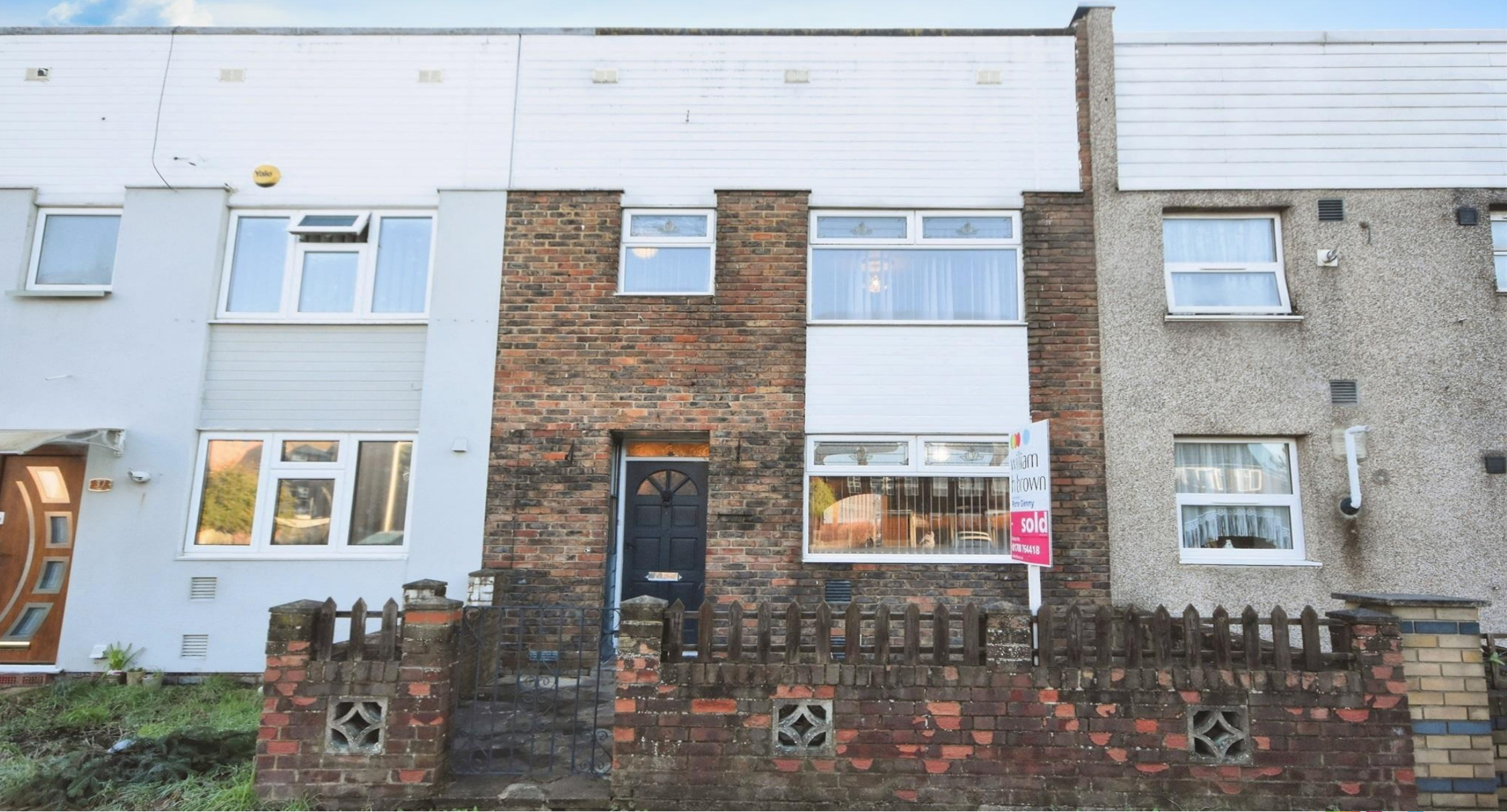
Clematis Close, Romford, RM3 8ES