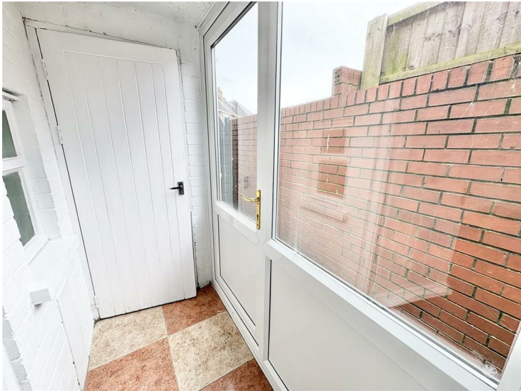
Rear Porch 6'0" x 3'1" (1.85 x 0.95)