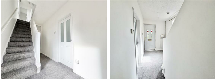
Entrance Hall 14'3" x 6'1" (4.35 x 1.87)