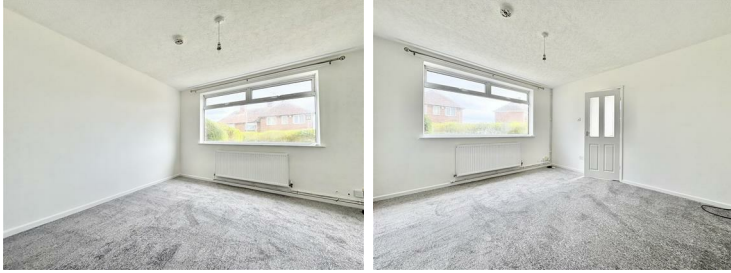
Reception Lounge 12'2" x 14'8" (3.71 x 4.48)