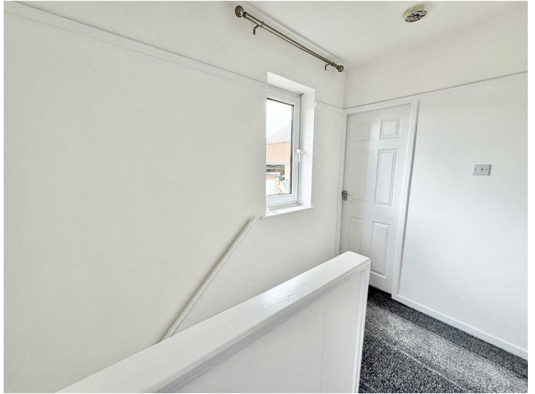
First Floor Landing 6'1" x 9'2" (1.87 x 2.80)