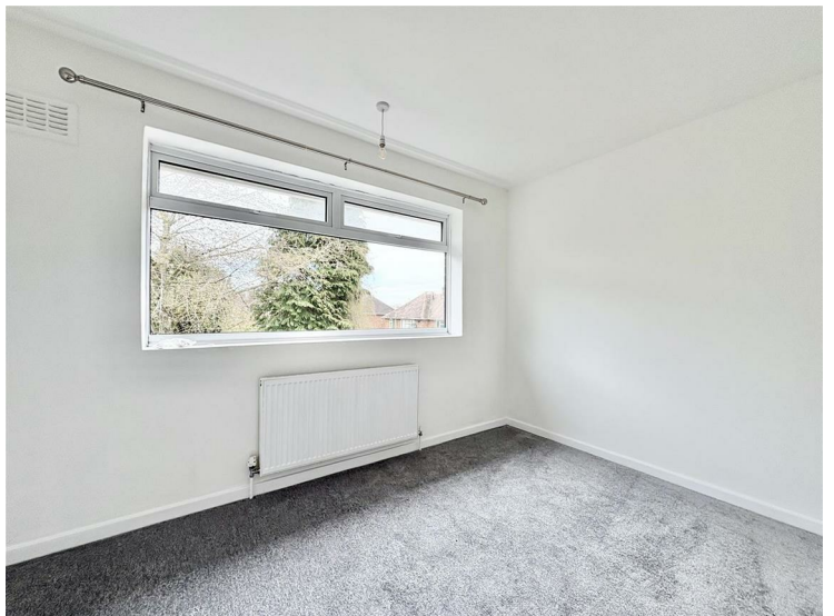
Bedroom Two 12'0" x 9'10" (3.67 x 3.00)