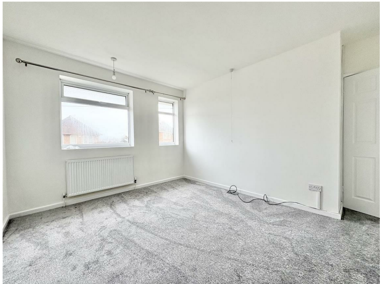
Bedroom One 12'1" x 14'2" (3.69 x 4.34)