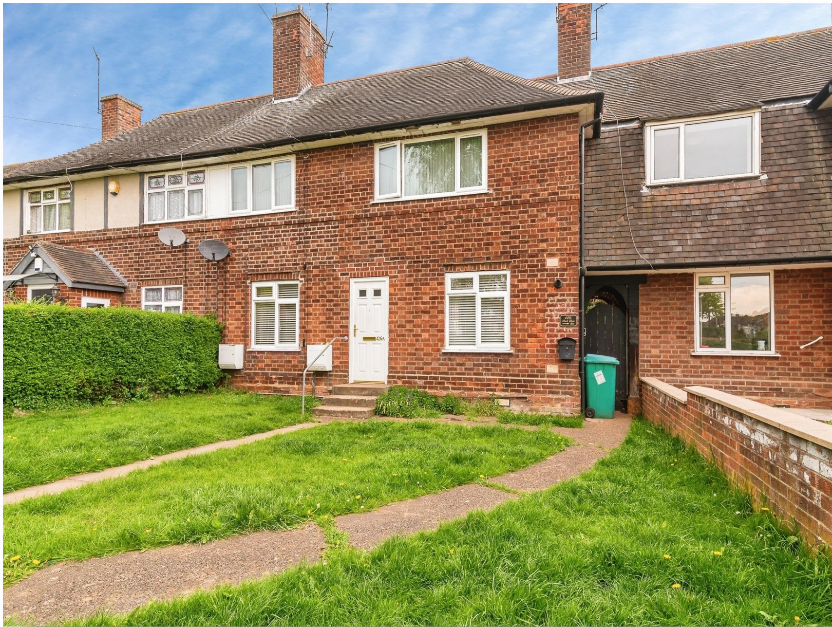
Aspley Lane, Nottingham NG8 5RS