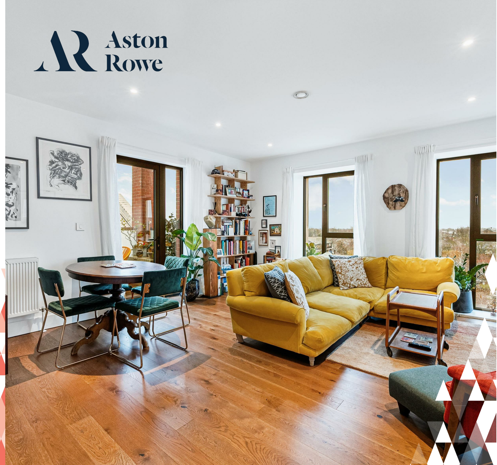
Dauphine House Approximate Gross Internal Area = 73.9 sq m / 795 sq ft