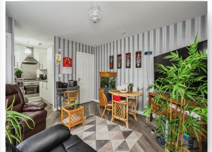
Haslar House, Blanchard Avenue, Gosport, PO13 8NR