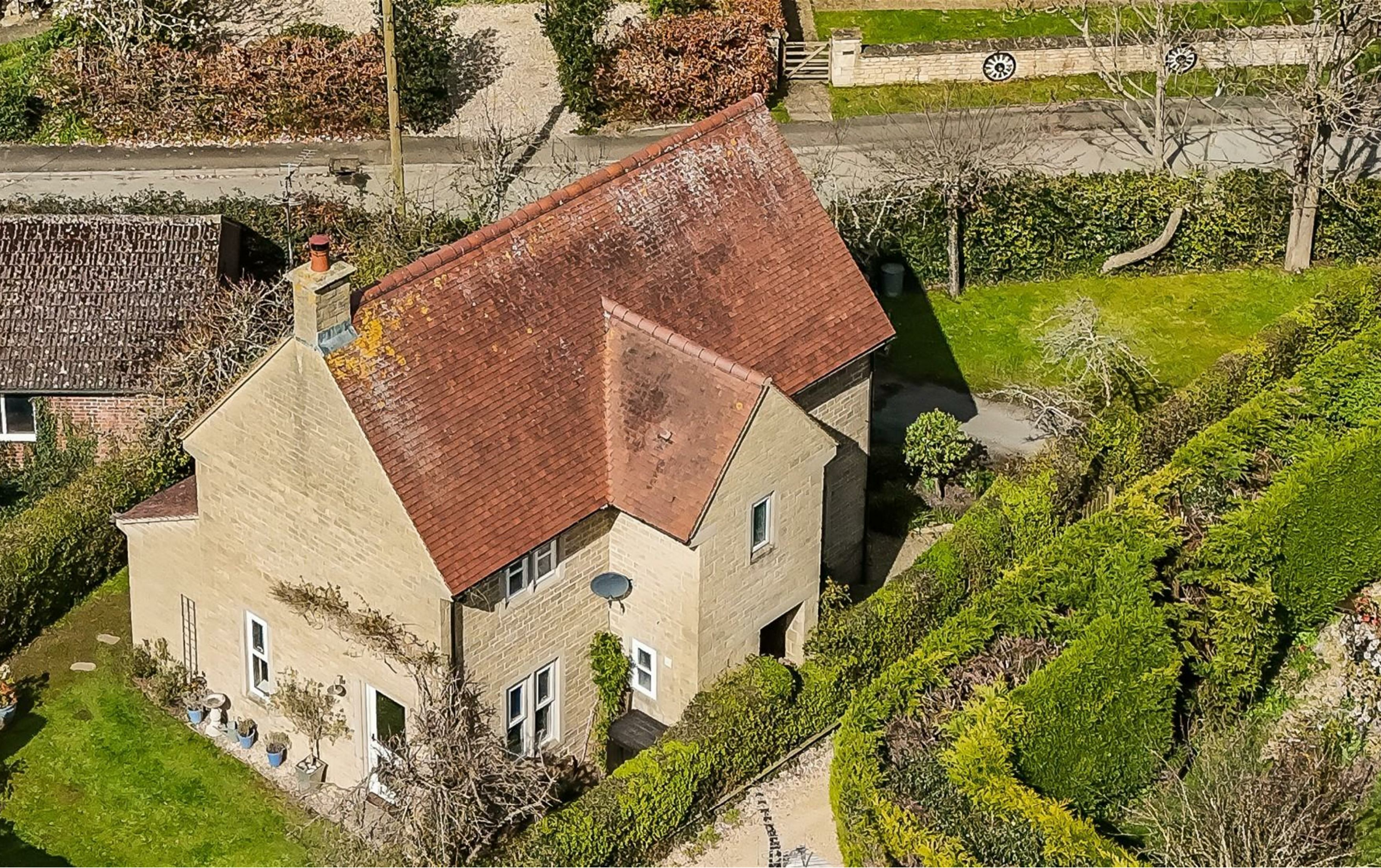
CRABTREE COTTAGE · HARESFIELD · STONEHOUSE