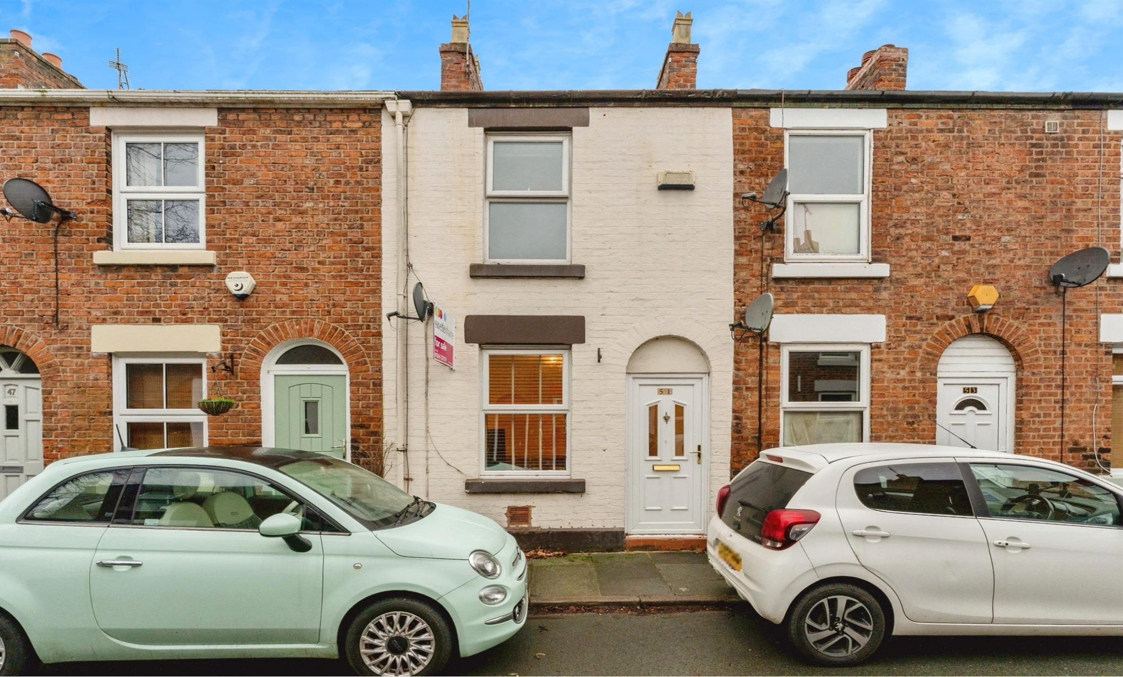
Gloucester Street, Chester CH1 3HR