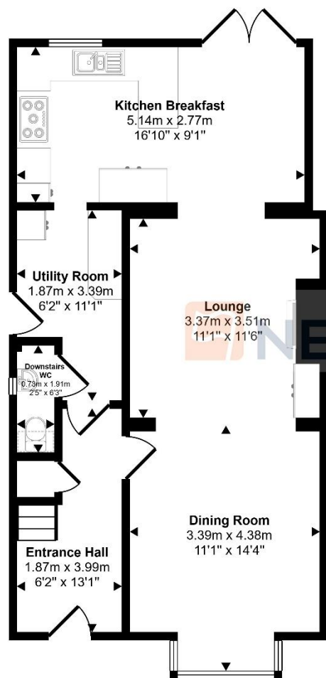
Ground Floor Approx 57 sq m / 612 sq ft

Approx Gross Internal Area 113 sq m / 1213 sq ft