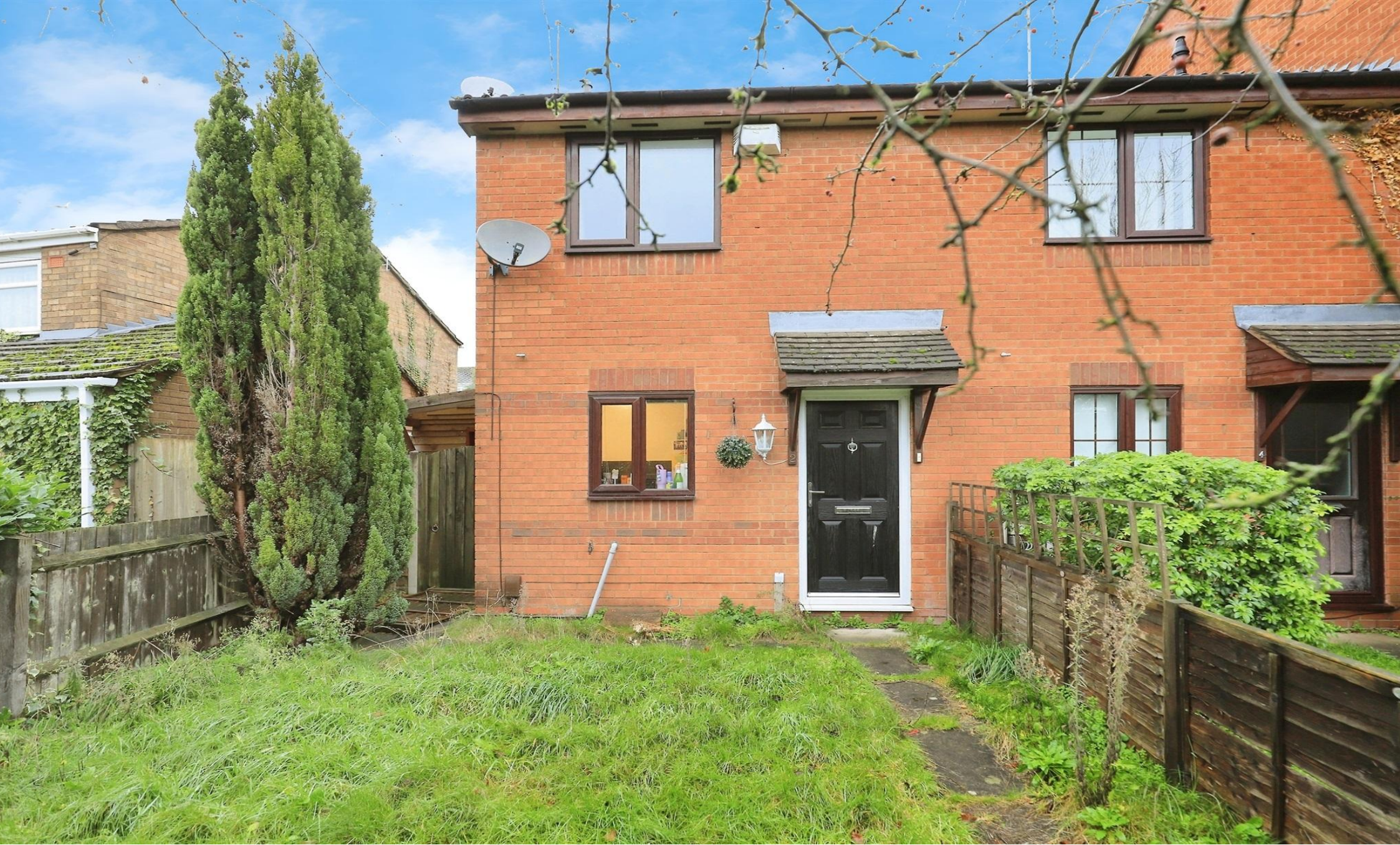
Adams Court, Kidderminster DY10 2SF