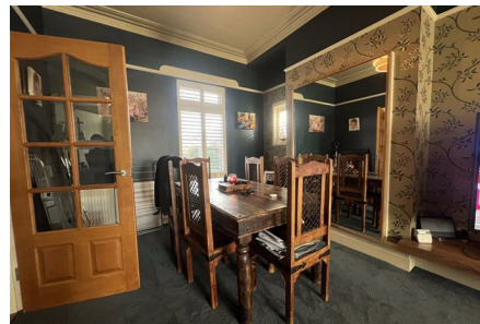
GOLF | CHARLOTTE HOUSE, GROUND FLOOR, 35-37 HOGHTON STREET, SOUTHPORT, MERSEYSIDE, PR9 0NS