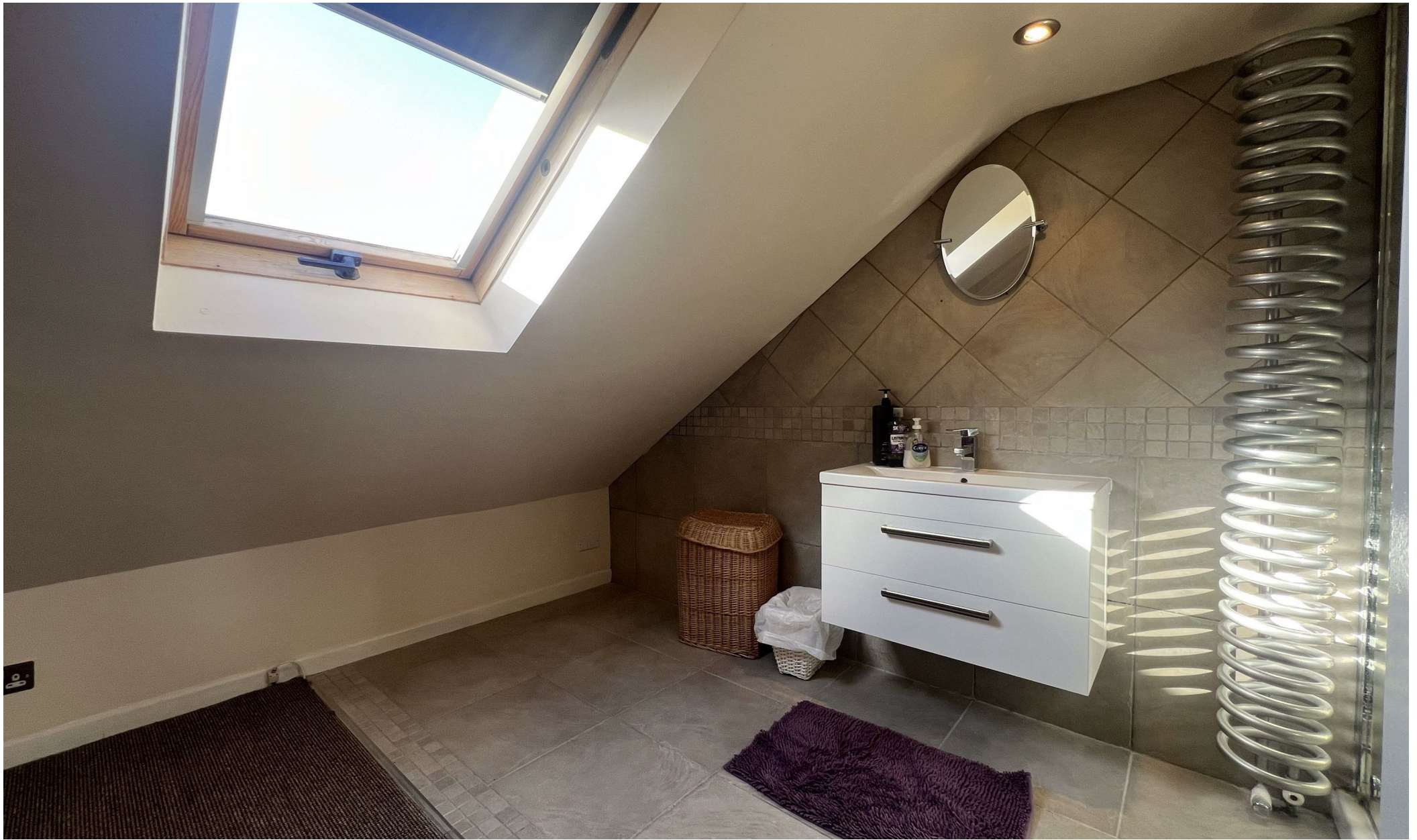
GOLF | CHARLOTTE HOUSE, GROUND FLOOR, 35-37 HOGHTON STREET, SOUTHPORT, MERSEYSIDE, PR9 0NS