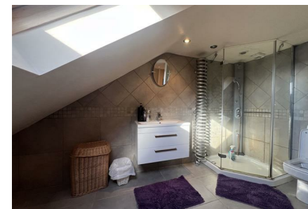
GOLF | CHARLOTTE HOUSE, GROUND FLOOR, 35-37 HOGHTON STREET, SOUTHPORT, MERSEYSIDE, PR9 0NS