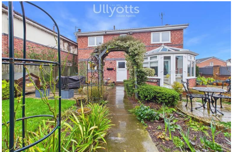
Rear Elevation & Double Garage