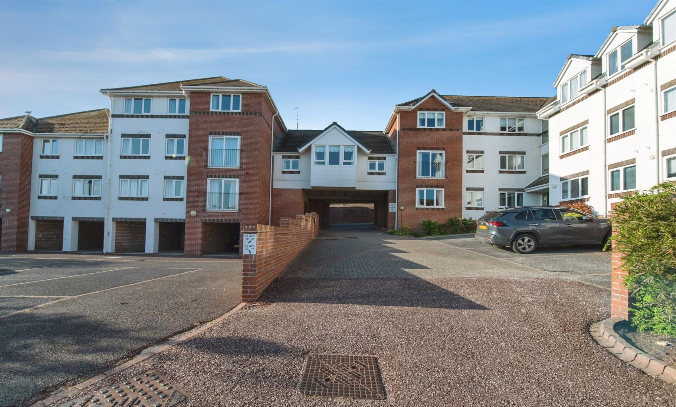
Cloverdale Court, Anning Road, Lyme Regis DT7 3ED