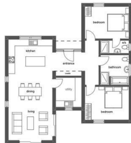
GROUND FLOOR 1:100