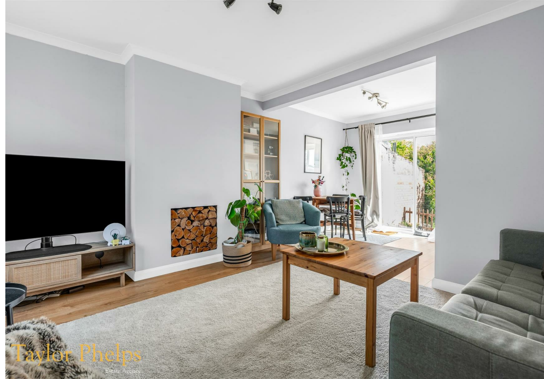
Taylor Phelps Estate Agency