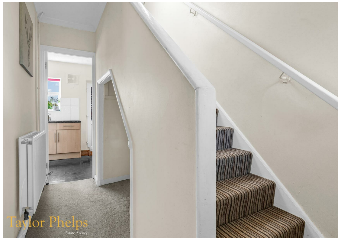
Taylor Phelps Estate Agency