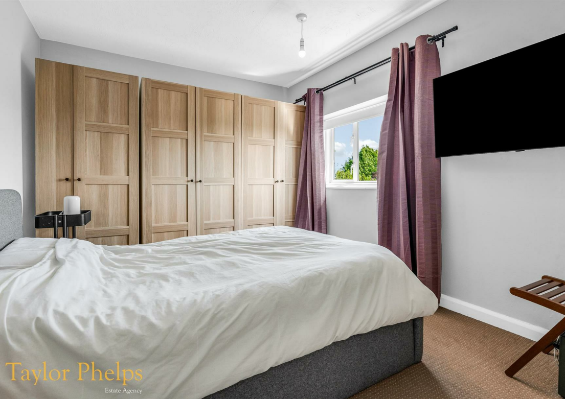
Taylor Phelps Estate Agency