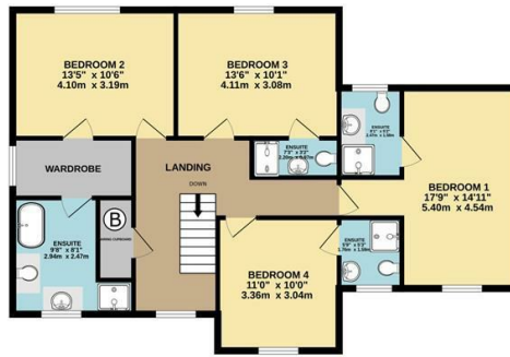
1ST FLOOR 955 sq.ft. (88.7 sq.m.) approx.