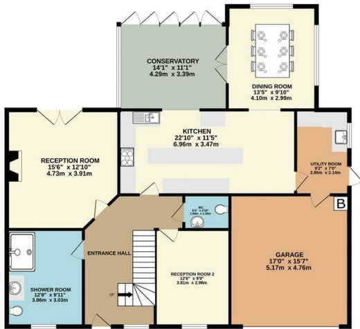
GROUND FLOOR 1564 sq.ft. (145.3 sq.m.) approx.