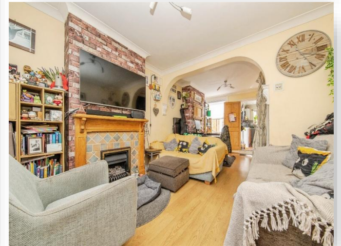
Granville Road, Colchester, CO1 2EE