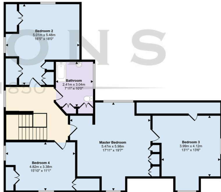
First Floor Approx 119 sq m / 1277 sq ft

This floorplan is only for illustrative purposes and is not to scale. Measurements of rooms, doors, windows, and any items are approximate and no responsibility is taken for any error, omission or mis-statement. Icons of items such as bathroom suites are representations only and may not look like real items.