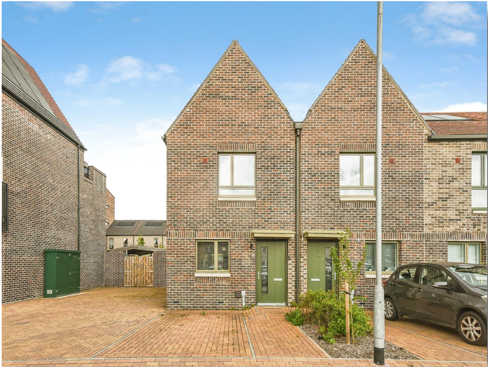
Little Walcot Lane, Swindon, SN3 3GJ