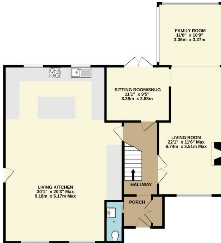
GROUND FLOOR 1136 sq.ft. (105.6 sq.m.) approx.