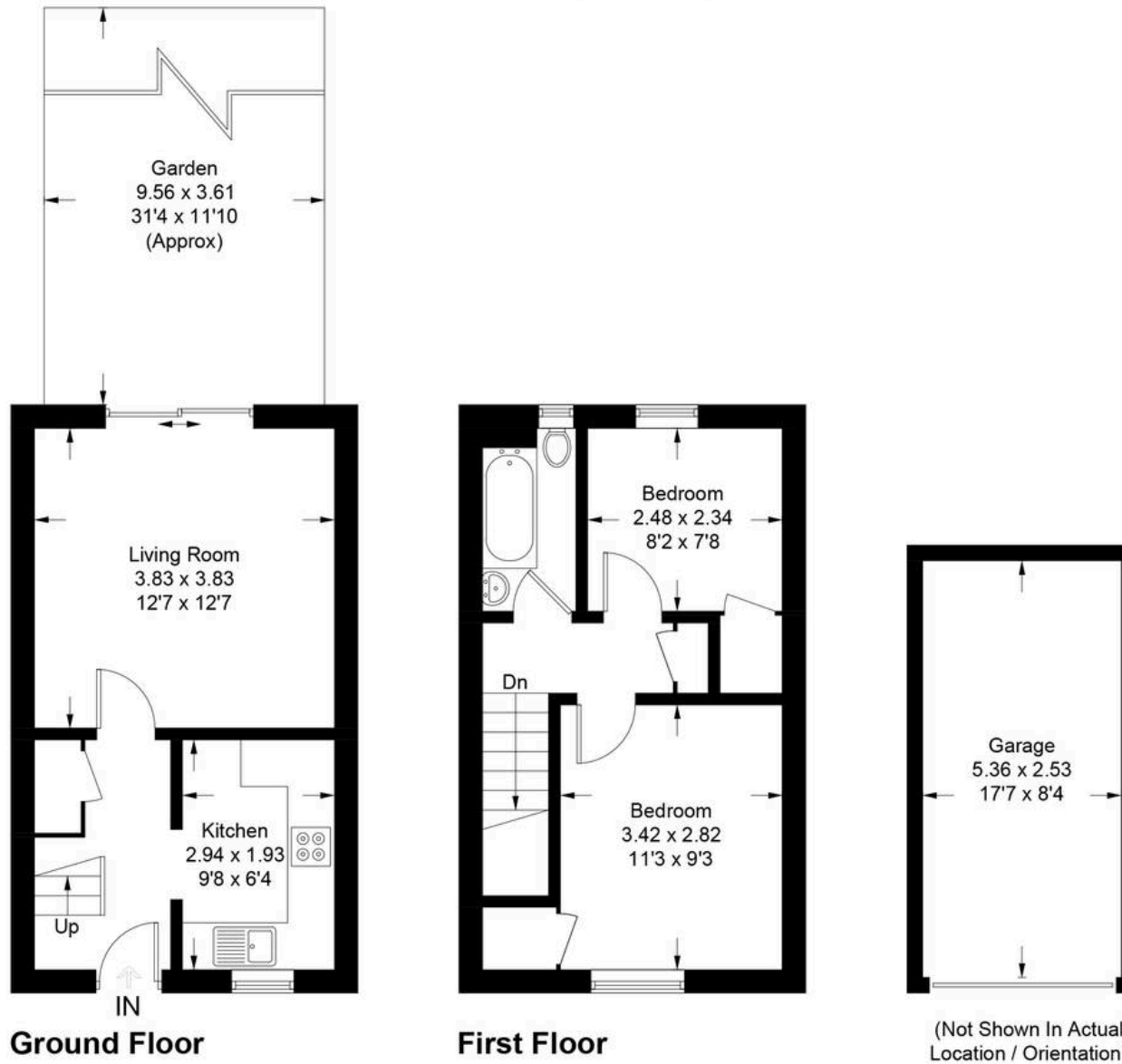
Illustration for identification purposes only, measurements are approximate, not to scale. Fourlabs.co © (ID1281145)