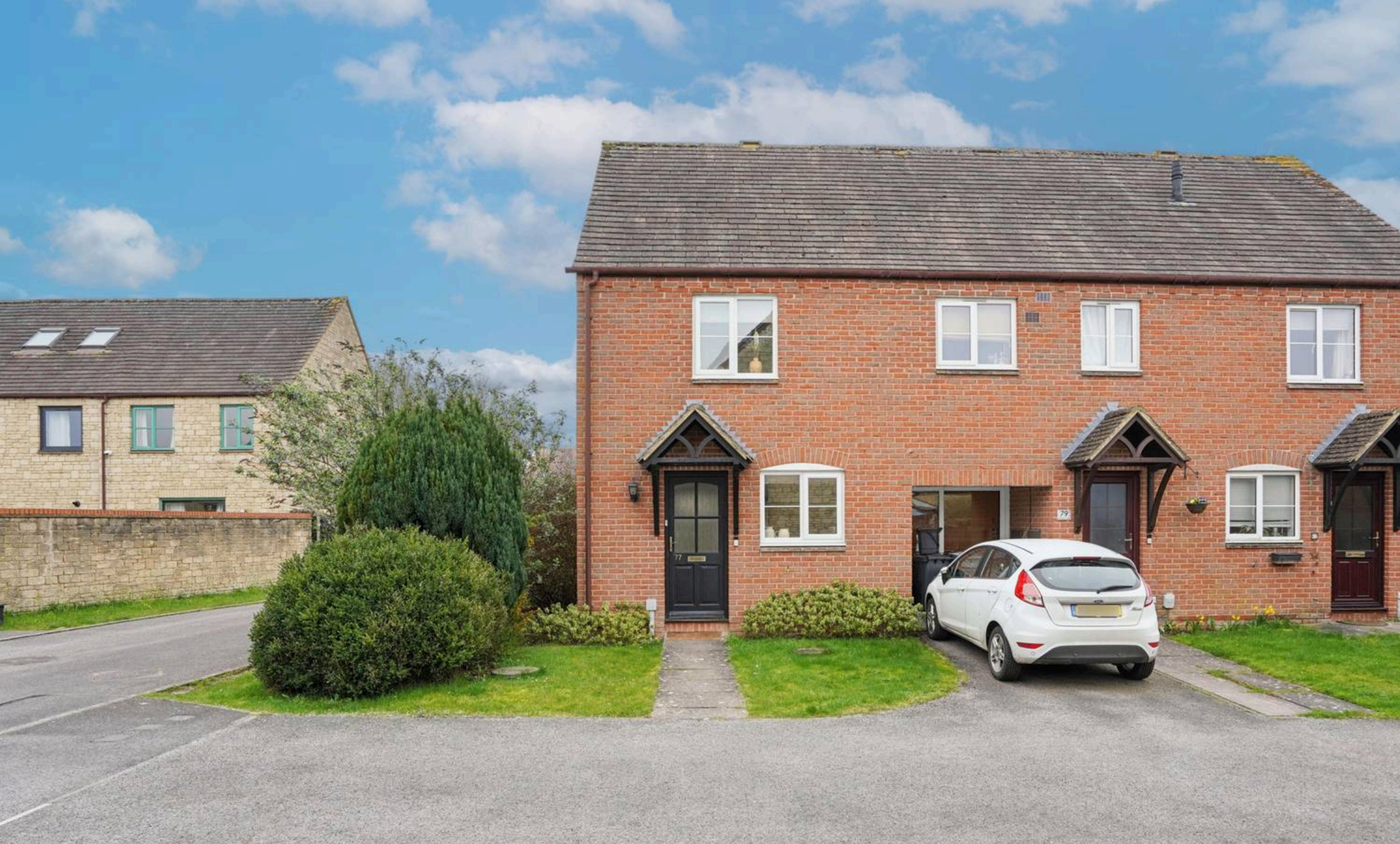
77 Snowhill Drive, Witney