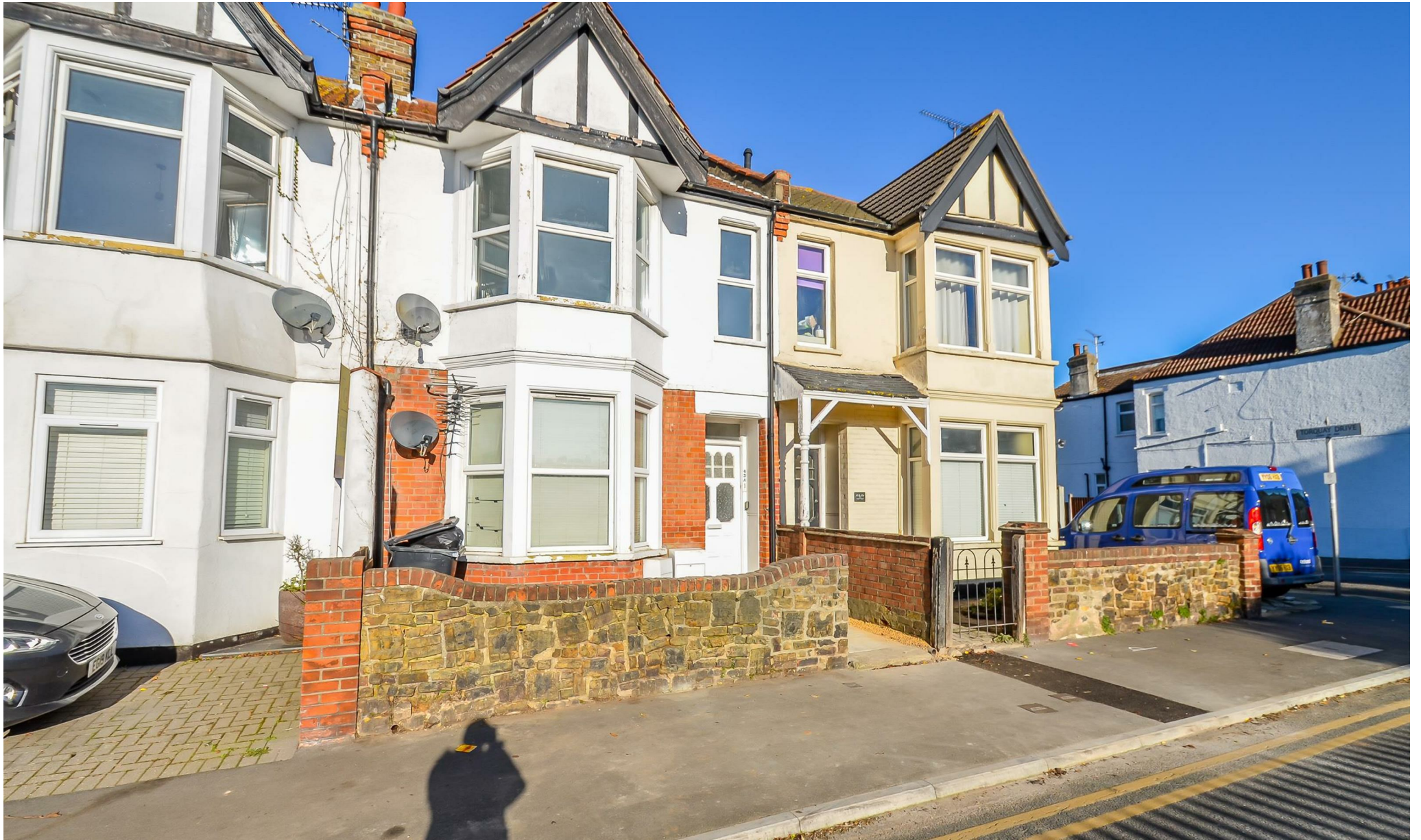
Pall Mall, Leigh-on-Sea £1,395 PCM