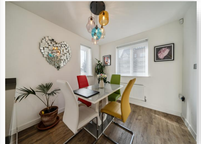
Heroes Drive, Birmingham B29 6UQ