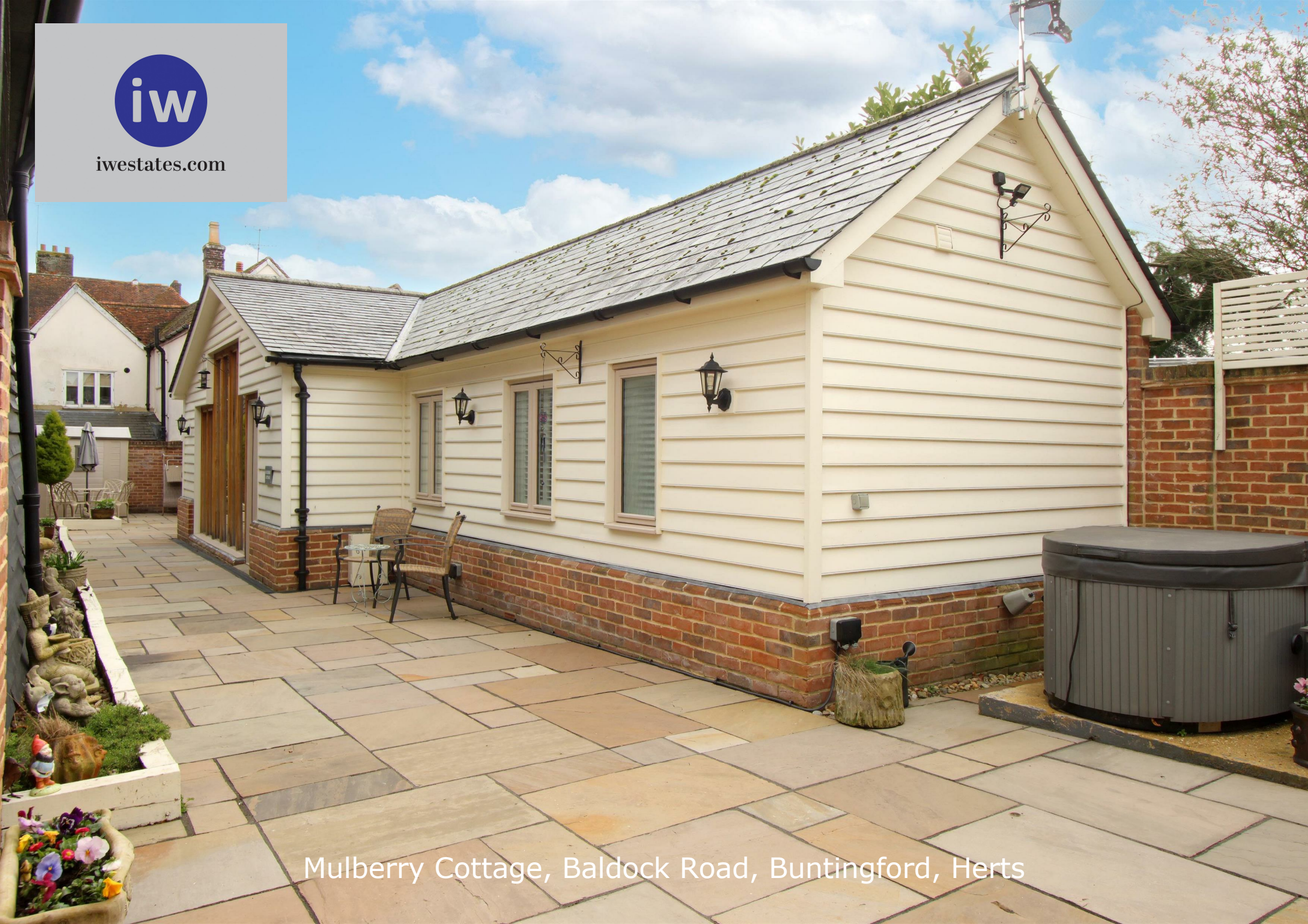
Mulberry Cottage, Baldock Road, Buntingford, Herts