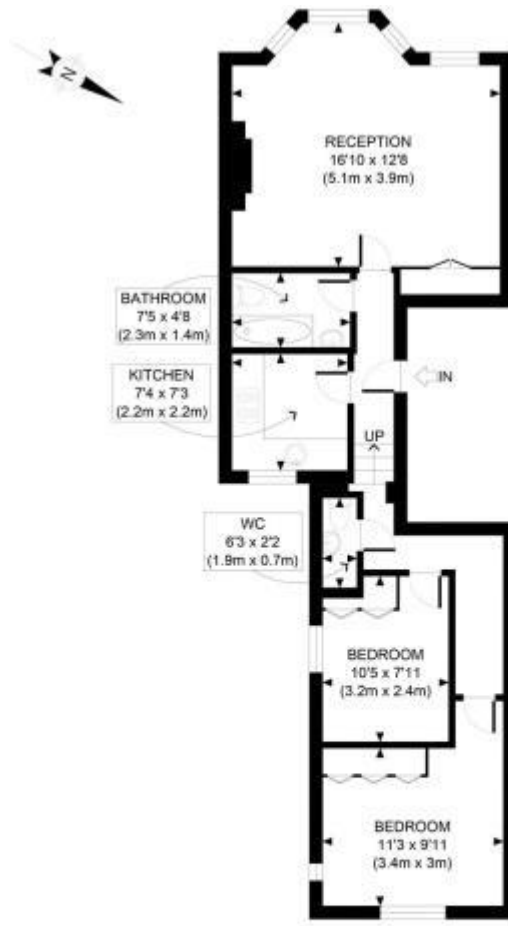
FIRST FLOOR GROSS INTERNAL FLOOR AREA 656 SQ FT

APPROX. GROSS INTERNAL FLOOR AREA 656 SQ FT / 61 SQM