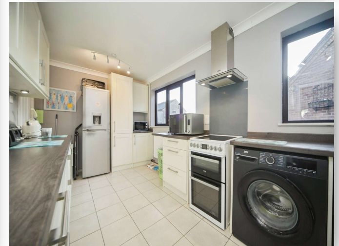
School Meadow, Stowmarket IP14 2SA