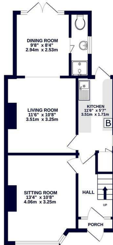
GROUND FLOOR 488 sq.ft. (45.3 sq.m.) approx.