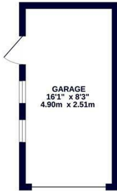
OUTBUILDING 133 sq.ft. (12.3 sq.m.) approx.