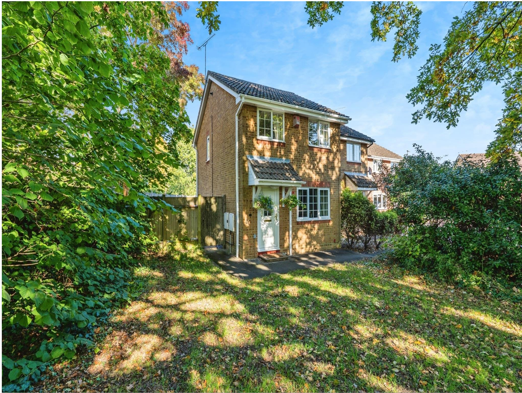
Birchlands, Totton SOUTHAMPTON SO40 7QB