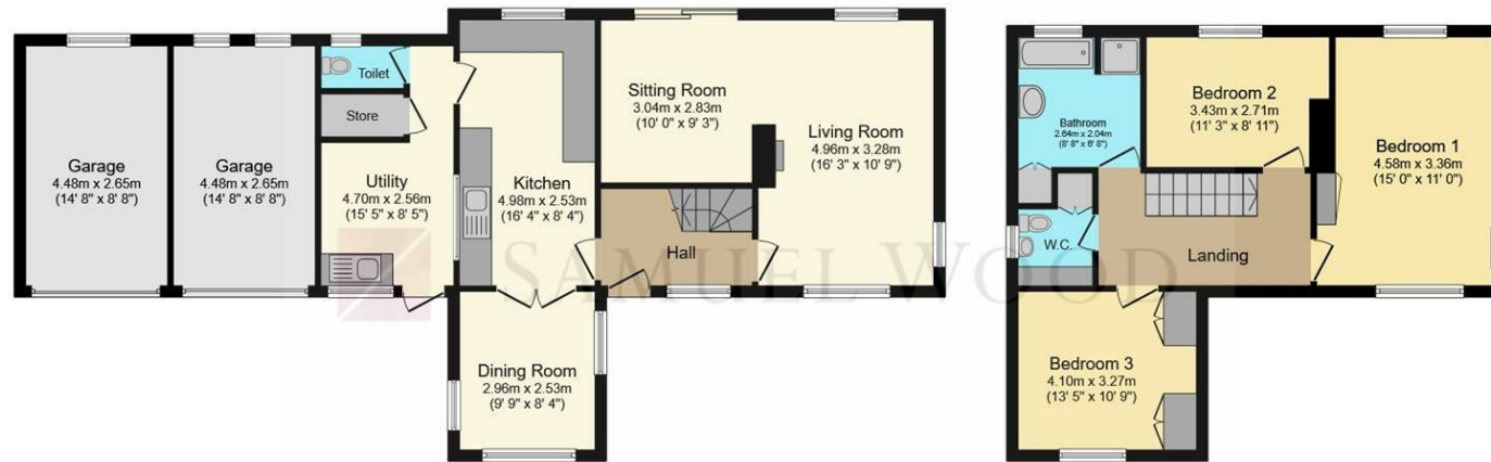
Ground Floor Floor area 87.8 sq.m. (945 sq.ft.)