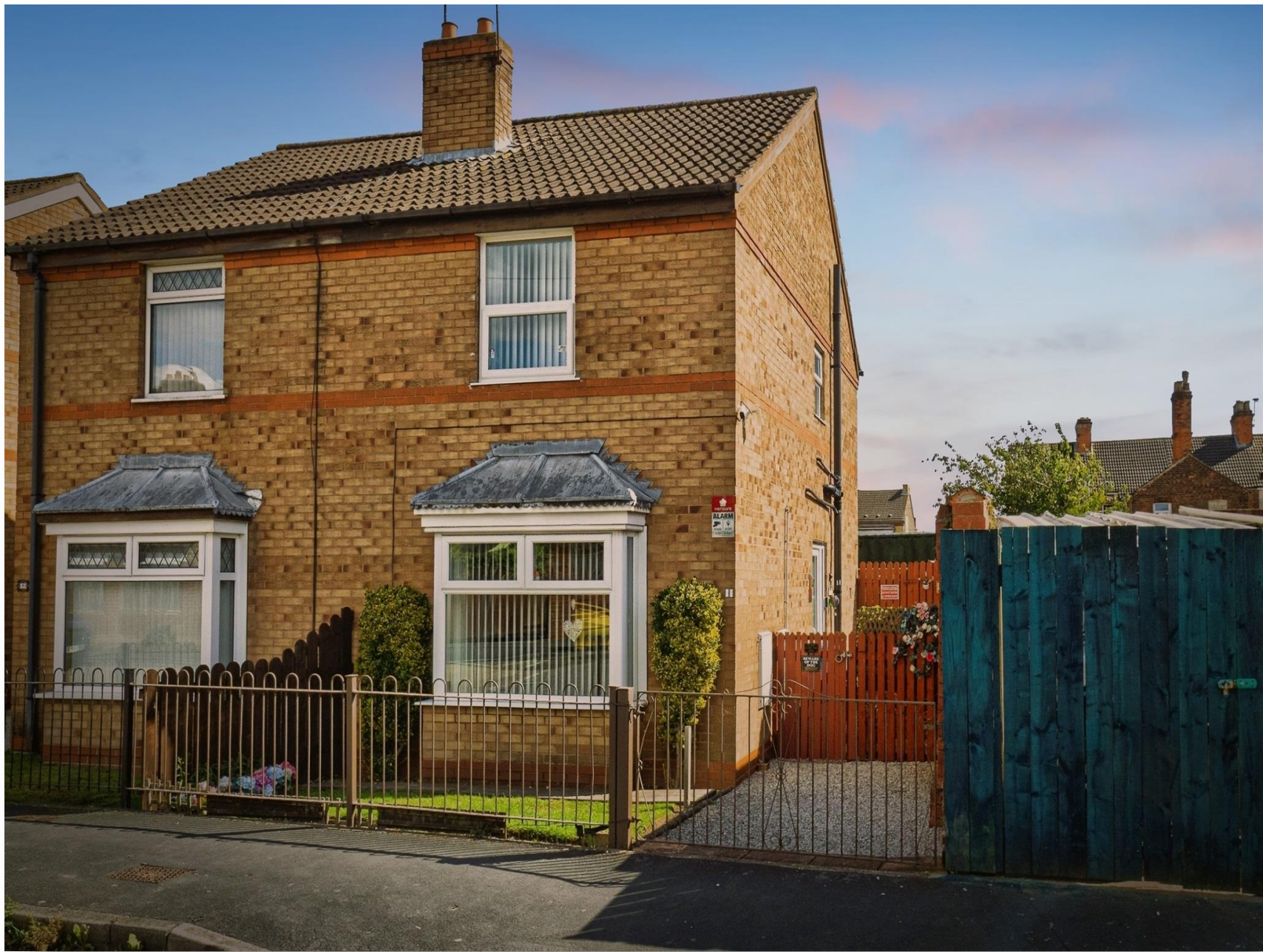
Manet Road, Hull, HU8 8QW