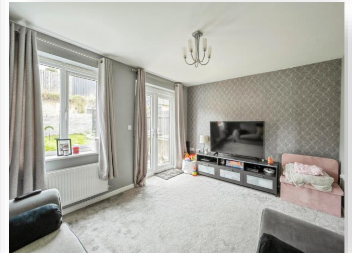
Smithy Croft, Bolton-Upon-Dearne Rotherham S63 8FG