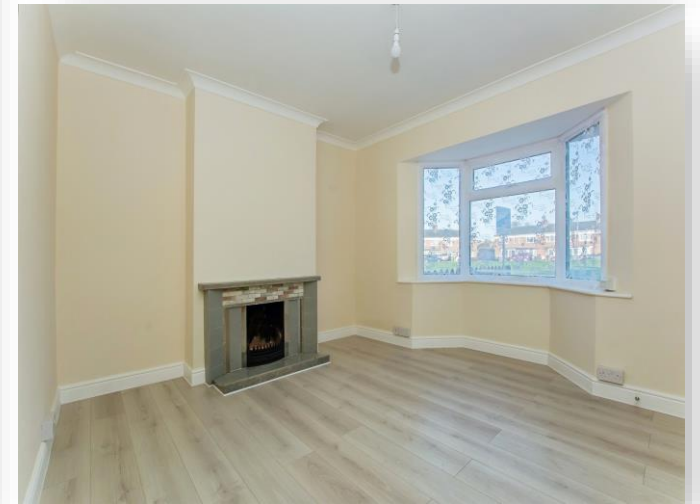
Summerfield Close, Wisbech PE13 1RP