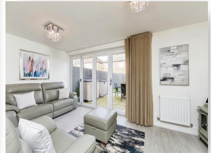
Green Shank Drive, Mexborough S64 0FH