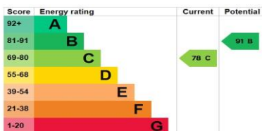
The graph shows this property's current and potential energy rating.