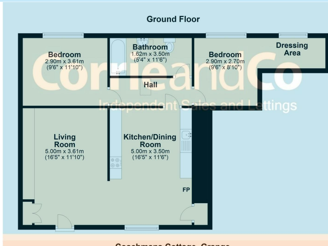
Coachmans Cottage, Grange

We are local, family run business who are wholly independent which means we can recommend services to most suit your needs. Our aim is to provide quality advice and expertise at all times, so you can make an informed decision whether buying or selling.