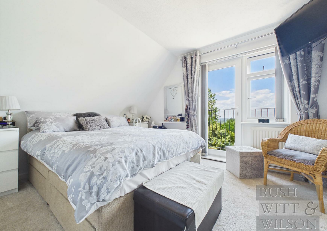
RUSH WITT & WILSON